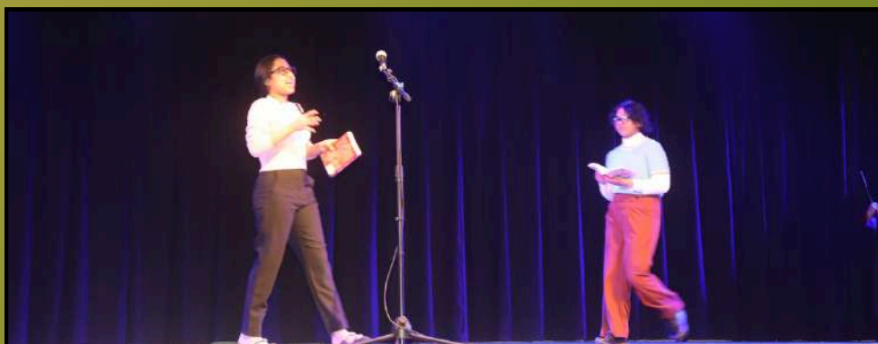
A charismatic display by the DP Year 1 students