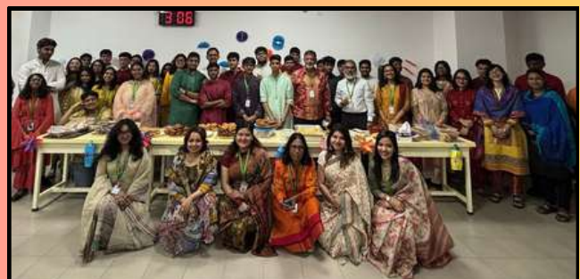
Coming together for the Pitha Uthshob