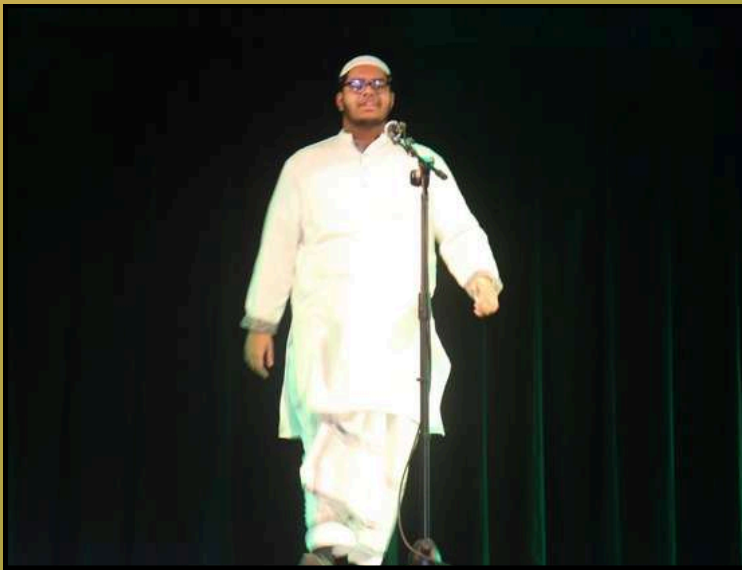
A student dressed up as a Bengali Literature character

This year's Book Week Costume Parade at our school was a vibrant celebration of literature, creativity, and talent. Students from MYP to DP took to the stage in a lively fashion show, showcasing their costumes inspired by their beloved book characters. The event was filled with energy as participants performed dances and brought their characters to life with enthusiasm. Teachers also joined in the festivities, demonstrating their artistic talents, with highlights including a captivating poem recitation by the student counselor. The event was a true testament to our school's love for books, storytelling, and the arts, making it a memorable experience for all.