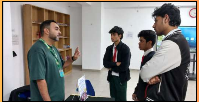
A serious discussion going on regarding the future