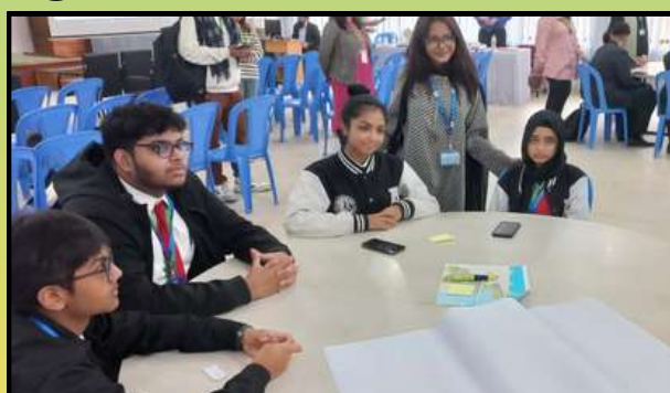
Students at the rickshaw painting session