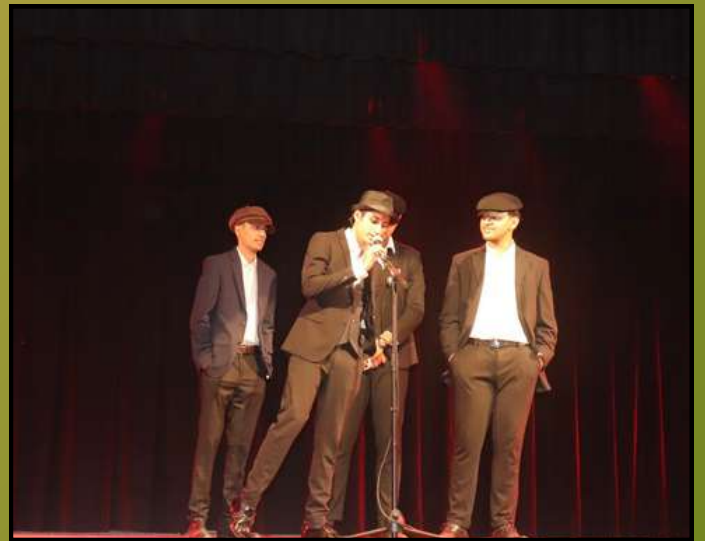
The Shelby Brothers from Peaky Blinders