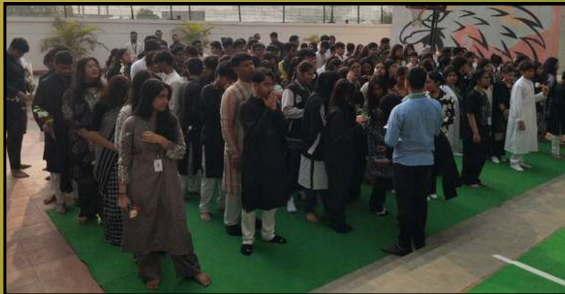
Students gathered to celebrate International Mother Language Day 2025

AusIS held a special whole-school assembly to commemorate International Mother Language Day of 2025. Students paid tribute to the day's significance by offering flowers at the Shaheed Minar, honoring those who sacrificed for linguistic freedom. The assembly featured a heartfelt singing performance, a moving poem recitation, a touching drama, and a graceful dance, all reflecting the importance of language and cultural identity. To symbolize the occasion, the entire school community dressed in black and white, creating a solemn and united atmosphere for this meaningful observance.