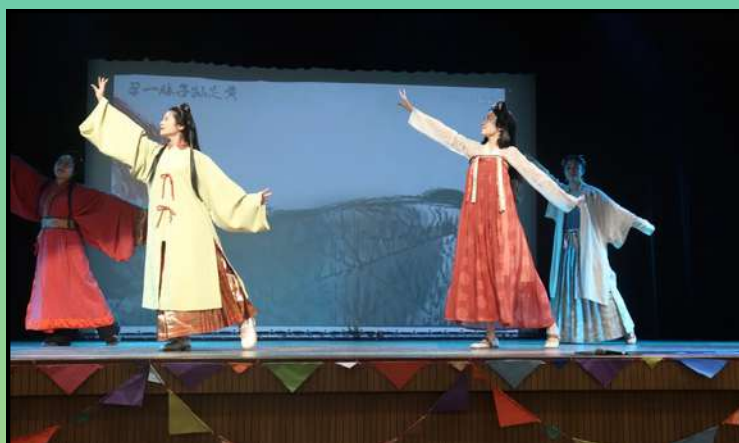
Traditional Chinese Dance

AusIS recently celebrated Chinese New Year with a vibrant and engaging event. Our Mandarin students impressed the audience with a special performance in Mandarin, showcasing their growing language skills. Special guests brought the festivities to life with a captivating fashion show featuring traditional Chinese attire and an exciting musical performance. The celebration provided students with a wonderful opportunity to immerse themselves in Mandarin culture and appreciate the beauty of Chinese New Year traditions.