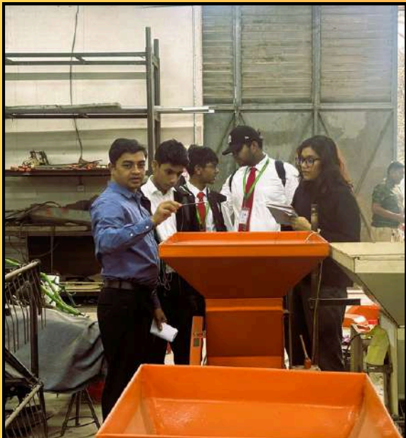
A BRRRI official explaining about sustainable farming

The DP Year 1 students of Australian International School Dhaka (AusIS) recently visited the Bangladesh Rice Research Institute (BRRRI) for their Collaborative Sciences Project (CSP). This insightful trip allowed students to explore cutting-edge agricultural research, including advancements in rice cultivation, genetic modification, and sustainable farming practices. During the visit, students engaged with researchers, participated in interactive sessions, and observed real-world applications of scientific concepts from their IBDP curriculum. This experience not only deepened their understanding of agricultural biotechnology but also highlighted the role of innovation in addressing global food security challenges.