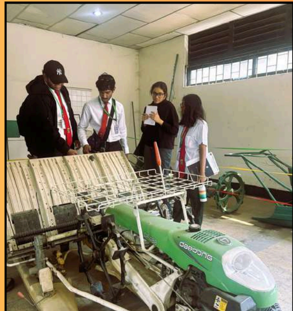
Curious students exploring farming machinery