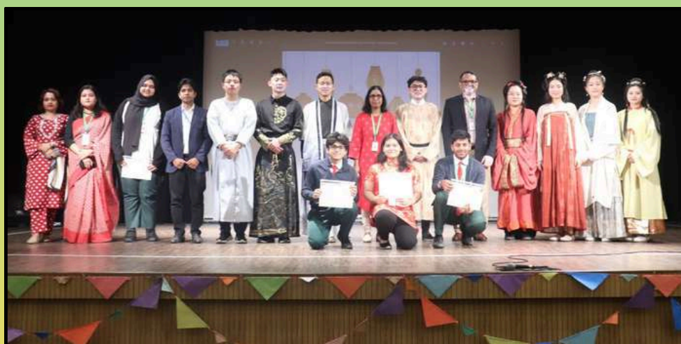
Prize winners with the guests