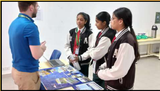
Students interacting with a university representative

This month our school had the opportunity to host representatives from several renowned universities, including the University of Buffalo, Washington State University, Central Michigan University, University of Arizona, University of Texas Arlington, Iowa State University, University of Kentucky, and Embry-Riddle Aeronautical University. These institutions provided valuable insights into higher education opportunities, programs, and campus lives, engaging with students across various grade levels. DP, WACE, and MYP 5 students had the chance to interact directly with the university representatives, gaining a deeper understanding of what these universities offer and how they align with their academic and career aspirations. The visit proved to be an excellent occasion for students to ask questions about admission processes, scholarships, and student lives, helping them make informed decisions about their future academic journeys.