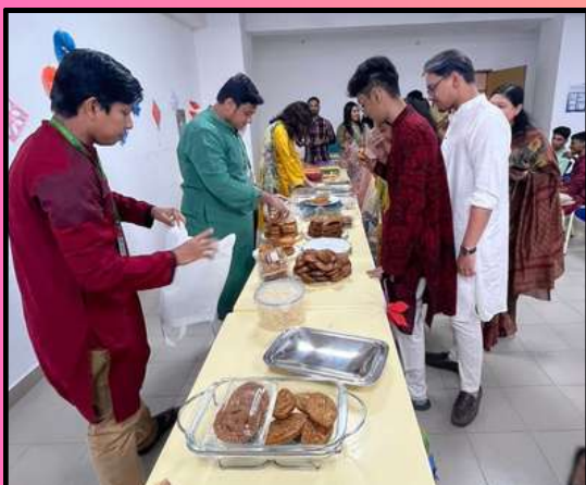
Teachers and students enjoying the pithas together

Pohela Falgun was joyously celebrated by the DP Year 1 and 2 students with the much-loved tradition of Pitha Uthshob. The students marked this special occasion by coming together to bring and share a variety of delicious pithas. From sweet to savory, the pithas represented a blend of rich cultural heritage and culinary delight, with everyone eagerly sharing their homemade treats with friends and teachers. The celebration was a colorful display of joy and unity. Students and teachers alike dressed in vibrant hues of yellow, red, orange, and white, which symbolize spring's arrival and the new beginnings it brings. The event was a wonderful reminder of the richness of Bengali culture and the importance of sharing these moments with one another. The Pitha Uthshob was a true reflection of the vibrant spirit of Falgun, bringing students and teachers closer while celebrating new beginnings with delicious food, vibrant attire, and joyful hearts.