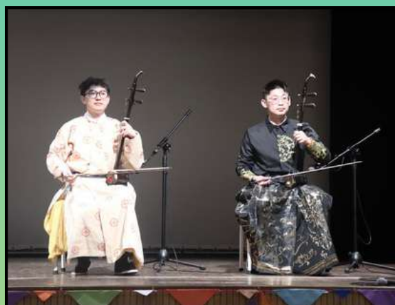
Guests playing an instrumental music