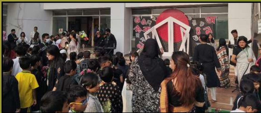
Students attentively listening to the opening speech