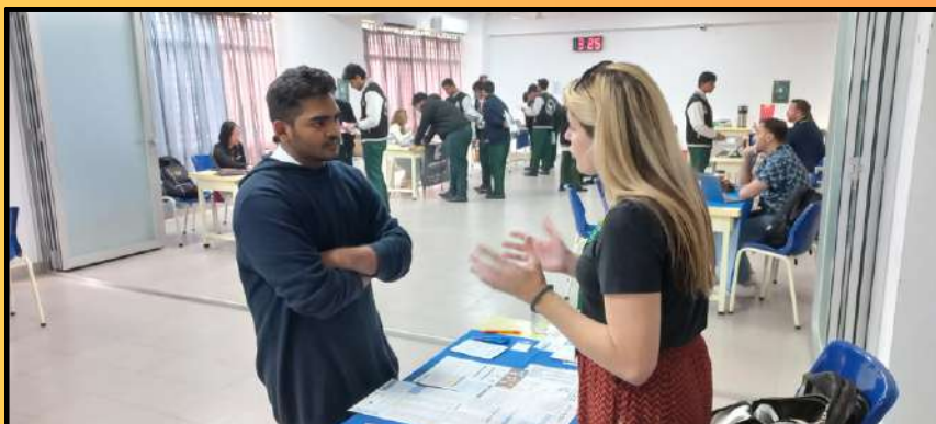
Texas Arlington's representative answering the student's questions