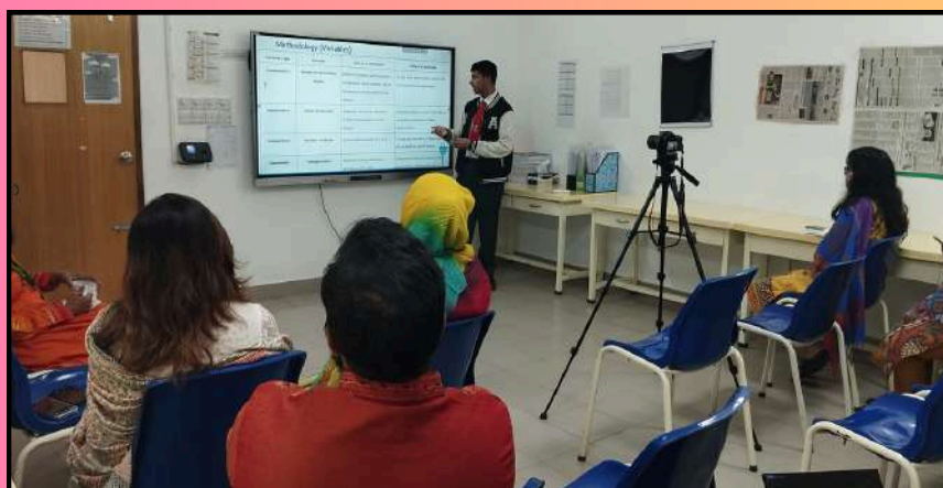
Teachers attentively listening to the student's presentation