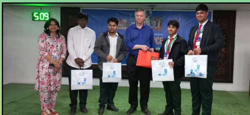
Winners of the competition with the Registrar of BRAC University

DP Year 1 and 2 students joined together for an adventure at the BRAC University Savar Campus. The trip consisted of a multitude of activities to keep the students busy. The day started with breakfast and then a group therapy session where they talked about anxiety, excitement, and different moments of their lives and how they evoked emotions. They correlated how different seasons made them feel and had a session of freely dancing to the music. Then, they got separated into teams and collaborated to create business proposals that were innovative and something that was needed in the everyday world. Teams were given 10 minutes to prepare and 2 minutes to present. The best proposal got a gift package as a reward. They also learned how to do rickshaw paintings from a very famous artist in Bangladesh. The day ended with a cultural event where students and teachers from AusIS sang together.