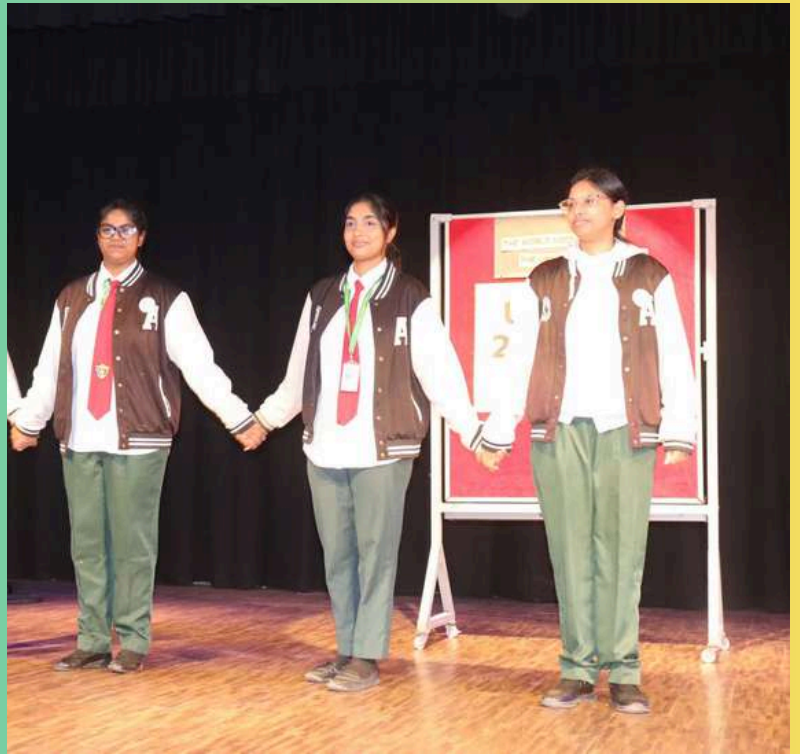
DP 2 students performing together on the occasion of UN Day celebration

The IBDP students played a pivotal role in the festivities, organizing a dynamic charades game where participants acted out the Sustainable Development Goals (SDGs). This interactive activity not only entertained but also deepened our understanding of global issues and the importance of collective action.