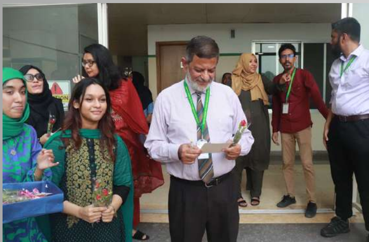
DP students welcoming the Principal with card and flowers

The celebration was made even more special by the return of a few of our former students, who came back to show their appreciation to the educators who guided them along their paths. The addition of dance shows by the students brought life to the event, with all participants deeply engaged in the festive atmosphere. The addition of present students and former students sent out a powerful message of gratitude and esteem, making it a memorable, complete experience for everyone involved. Teacher's Day inspired us and brought to light the lasting influence that teachers have on our existence.