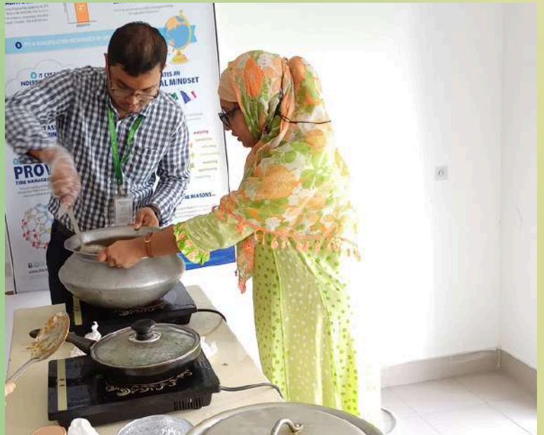
Super busy with cooking the main dish!

The DP teachers have had an amazing opportunity to share and cherish a wonderful experience on the teacher's cooking day. Our wonderful teachers collaborated to cook some amazing dishes from the Bengali cuisine. The main stars were the Chicken Biryani which is full of rich spices and tender chicken and the Egg Korma with its flavorful gravy.