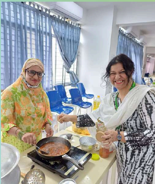
Teachers are busy cooking and enjoying the food