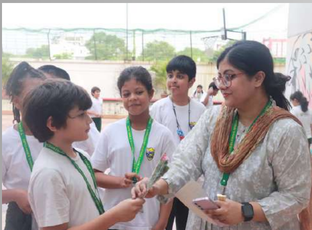
PYP students greeting their teacher with flowers

This year, our school marked Teacher's Day with a sincere gathering to pay tribute to our amazing teachers. The DP students played a significant role by making custom posters, distributing flowers and chocolates, and creating a cozy, inviting setting. The mood was brimming with happiness as students and educators enjoyed spirited times and preserved memories through photographs. The day was a mixture of thanks everywhere, artistic expressions on the walls and gifts, and the overall festivity, highlighting our recognition of the direction and assistance our teachers offer.