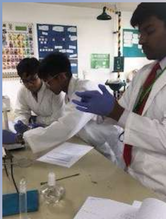
Future chemists are learning how to turn their ideas into reactions!

Even with a couple of small accidents and some chemical spills, both teams were able to reach their goals by the lab's end, leaving us feeling successful. There were a few mistakes in measurements, but the educational process was enjoyable and beneficial. The comprehensive lab report that follows will explore the reasons behind these mistakes and assist us in enhancing our skills. This lab experiment highlighted that engaging in experimentation through trial and error not only enhances comprehension but also makes the learning experience enjoyable and unforgettable.