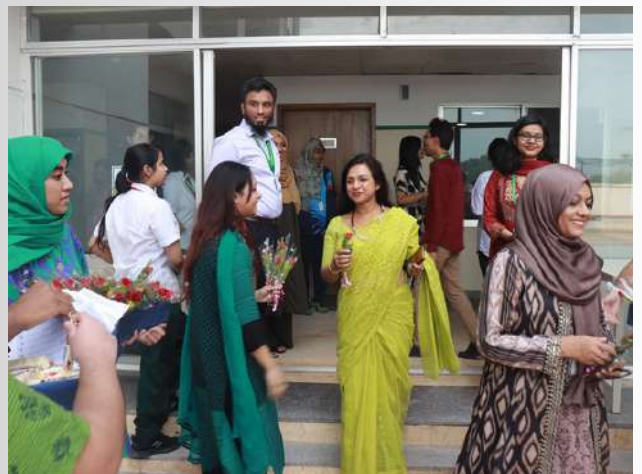
Surprised teachers making their way towards the celebration of Teachers' Day