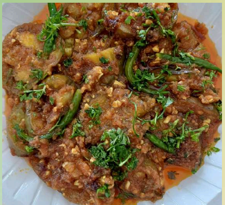
Delicious mashed eggplant cooked by the teachers!