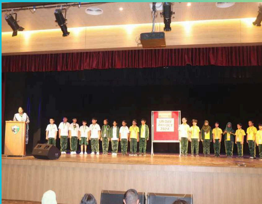
PYP students reciting a poem on the UN Day

Our principal delivered an inspiring speech, emphasizing the vital role of the UN in shaping us as responsible global citizens. He urged everyone to engage actively with the SDGs and to recognize our responsibility in addressing global challenges.