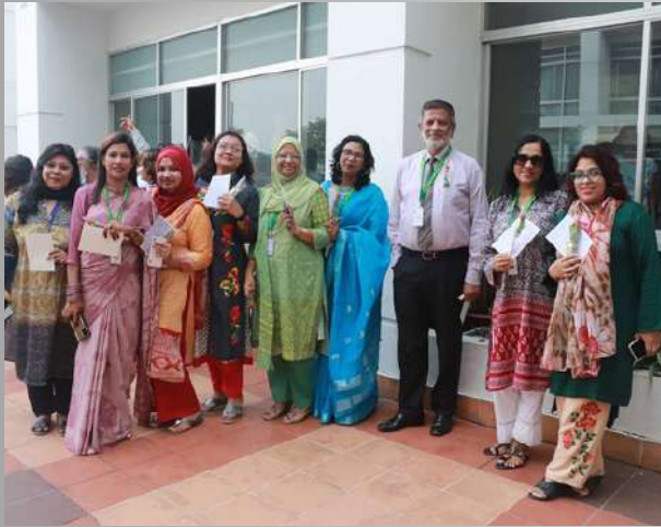
Teachers and the Principal are joyously posing for photos

This year, our school marked Teacher's Day with a sincere gathering to pay tribute to our amazing teachers. The DP students played a significant role by making custom posters, distributing flowers and chocolates, and creating a cozy, inviting setting. The mood was brimming with happiness as students and educators enjoyed spirited times and preserved memories through photographs. The day was a mixture of thanks everywhere, artistic expressions on the walls and gifts, and the overall festivity, highlighting our recognition of the direction and assistance our teachers offer.